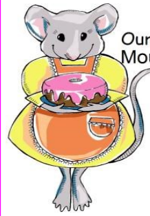
Our Dedicated Mouse

July 7 & 14 Chuck & Peggy Whitcome July 21 & 28 Wana Thacker & Irene Lillis