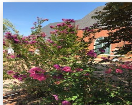
A shady spot in the church garden.

Our mission is to glorify God, reach out to people of all ages and in all levels of spiritual growth in worship, Christian education, music and fellowship. Trumpet the good news we share of God's love and forgiveness, of Jesus Christ and his gospel to people everywhere throughout the local church community and the world.